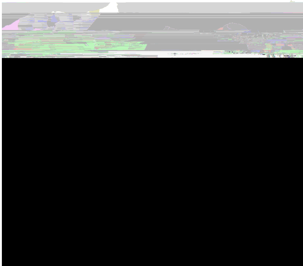
Figure 1 - Areas of control as of December 13, 2017. Arrows indicate advances made during the reporting period.

A political standoff is due to come to a head in the opposition-held Idlib pocket with the HTS-backed Salvation Government calling for the rival Syrian Interim Government (SIG) to vacate all offices by Friday, December 15. The SIG has called on units affiliated with the Free Syrian Army to protect SIG personnel and offices. Elsewhere, ISIS forces in eastern Hama governorate significantly expanded their territorial control, capturing at least seven small towns from HTS, briefly entering the administrative border of Idlib governorate before being pushed back by an HTS counteroffensive. ISIS advances in the area have benefitted from heavy Russian and government aerial bombardment of opposition forces as well as a simultaneous government offensive 15km to the west of ISIS positions. Government troop movements in the area are poised for a major offensive – most likely in an effort to take the Abu Dhuhur air base and gain control over the Hama-Aleppo highway.